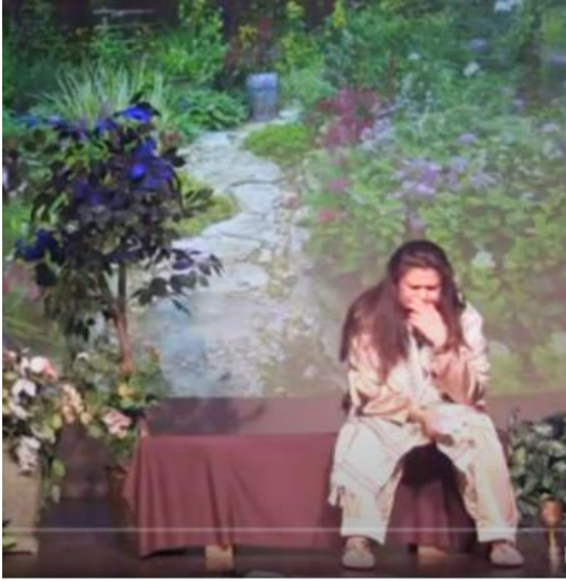
Gordafarid despondent at the Death of Sohrab.