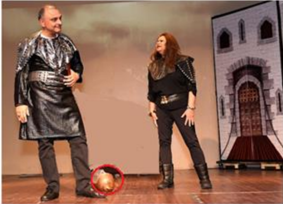
Sohrab topples Gordafarid's helmet revealing her face